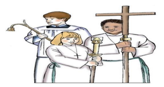
Calling all Altar Servers